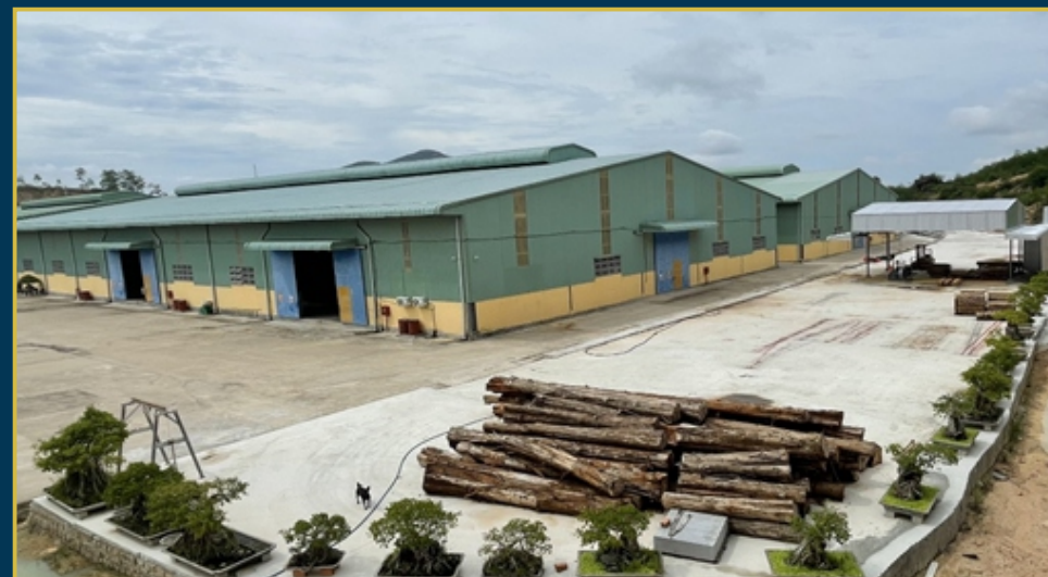
FACTORY (GOLD STAR 2)