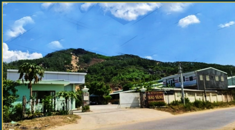
FACTORY (GOLD STAR 1)